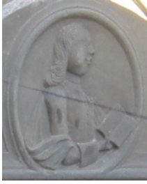
Reverend holding Bible