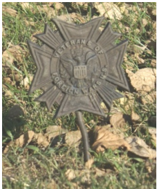
Veterans of Foreign Wars VFW marker