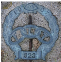
International Order of the Odd fellows I.O.O.F