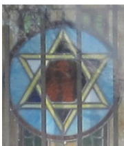
Star of David