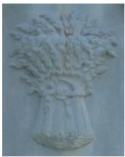
Bushel of Wheat

Strife and confusion, one of Satan's animals