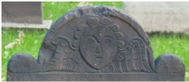
Head with Angel Wings