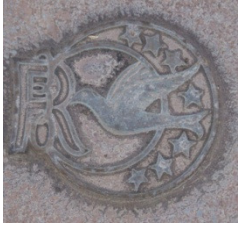
Daughters of Rebekah(Women's Auxiliary to I.O.O.F.)