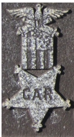
Grand Army of the Republic Civil War Veteran Organization