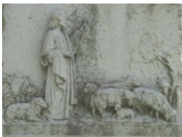
Jesus and his flock