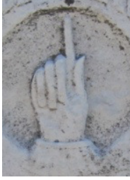
Finger pointing to Heaven

Soul rising to Heaven, two fingers pointing up; hand of God