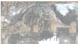
Weeping man under Weeping Willow tree leaning on urn with coffin