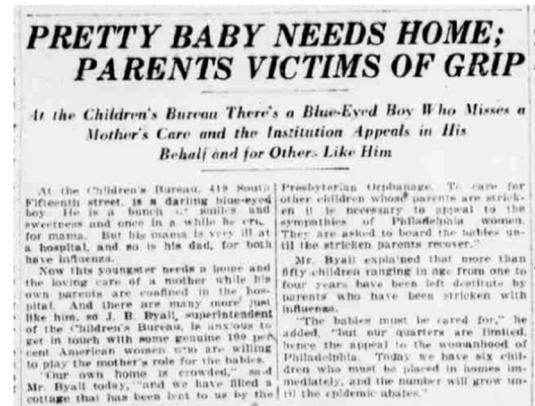
Philadelphia Public Ledger October 14, 1918

Commander acts quickly, refuses liberty leave to all and quarantines 1,000 symptomatic men.