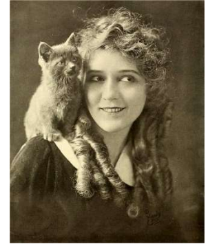
Mary Pickford

FDR, Assistant Secretary to the Navy, contracts the flu. Walt Disney, Mary Pickford, Bess Wallace all contract the flu and survive.