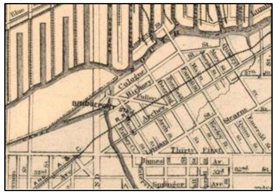
1883 O. W. Gray and Son Map of Chicago www.chicagoinmaps.com

spread out into every neighborhood in Chicago. The website Chicago in Maps <a href="https://www.chicagoinmaps.com">www.chicagoinmaps.com</a> is a great resource for following Chicago's expansion from the 1830s through the 1990s.