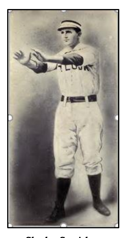
Charles Comiskey Internet Archives http://bit.ly/2aMV39U

http://archives.archchicago.org for additional records. You can find more information on Chicago's Catholic churches through sites like <a href="https://www.chicagoancestors.org">www.chicagoancestors.org</a>. Here, Catholic churches are pinned to a Google map platform showing information on the opening and closing of the church, the ethnicity of the parishioners and where the records are now held. The Encyclopedia of Chicago <a href="https://encyclopedia.chicagohistory.org">http://encyclopedia.chicagohistory.org</a> also has chapters on Chicago Irish and the aforementioned Catholic parishes, homes and orphanages.